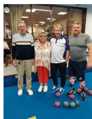
Killer Pairs finalists