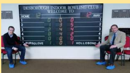
Congratulations to the Crusaders and their helpers

Both MPs were mightily impressed by the skill and commitment of the members and complimented the club on the convivial and supportive atmosphere that surrounded the session.